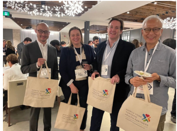
NYTHP PCN Connecting Care Evening in 2023.