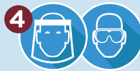
Remove Eye Protection