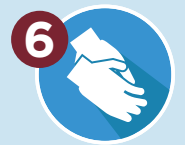
Perform Hand Hygiene