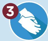
Perform Hand Hygiene