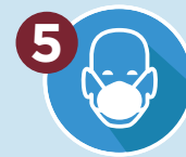
Remove N95 Respirator